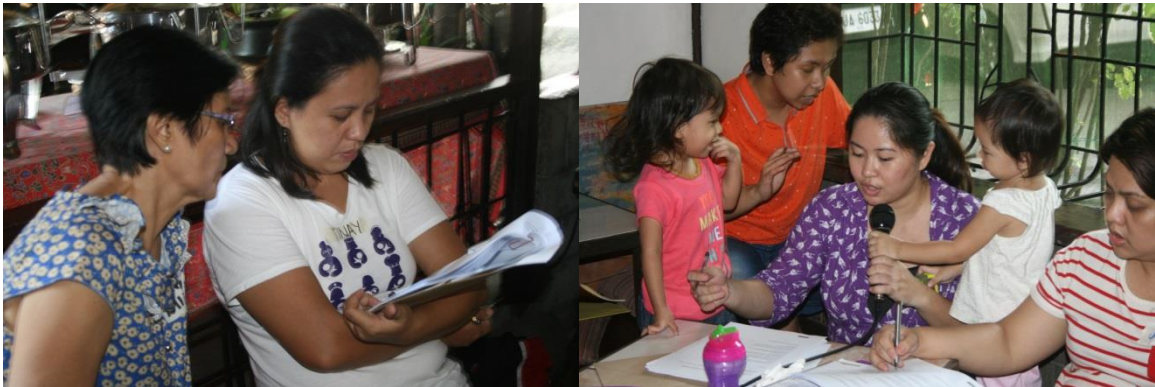
WBTi participants: moms, doctors, lawyers, community leaders