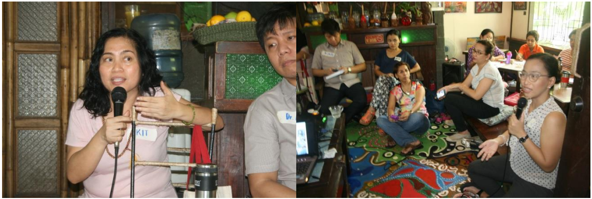
Two opposing feminist groups : Akbayan (socialists) and Gabriela (communists) with differing ideologies usually never join together but the WBTi obliged them to sit down in Arugaan organized workshop in defense of maternity protection