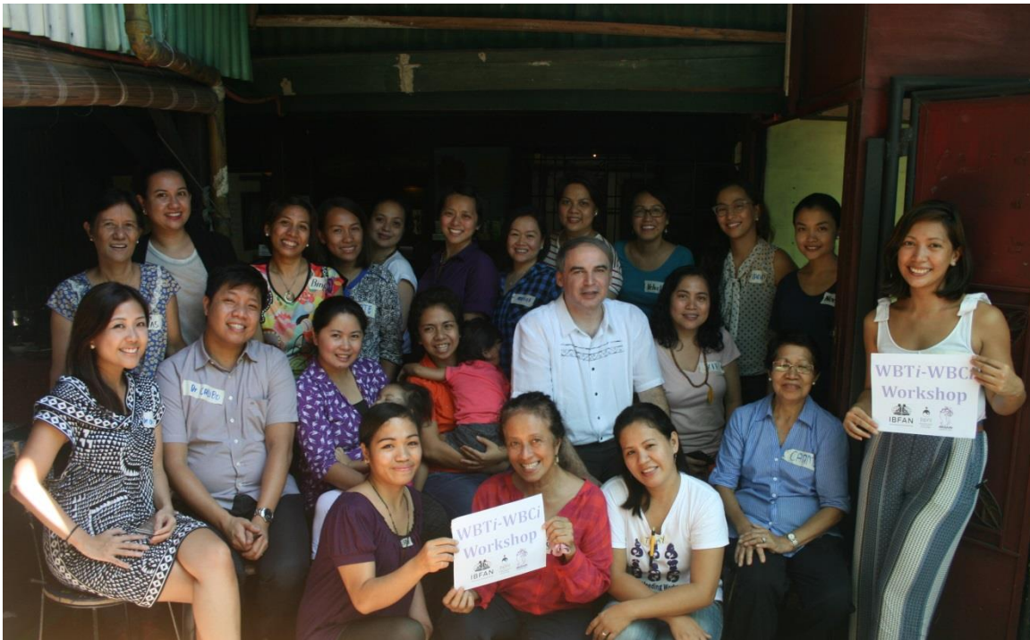
WBTi workshop participants-leaders representing multi sectoral organizations and agencies

The WBTi Report was an outcome of the intensive interactive workshop amongst leaders representing 15 multi sectors from government Department of Health (DOH /MOH), National Nutrition Council, medical association Philippine Pediatric Society, United Nations agencies WHO, ILO, legal professionals Health Justice, workers group Trade Union of the Philippines, feminist groups Gabriela and Akbayan as Partylists of the House of Representatives and Chief of Staffs representing the law makers in the Congress/Parliament. Breastfeeding groups: Breastfeeding Pinays, LATCH, Pinay Doulas Collective, Arugaan mothers support groups from the communities as well as Fathers Support groups called Tatay and the National Press Club of the Philippines. A total of 25 participant-leaders attended actively.