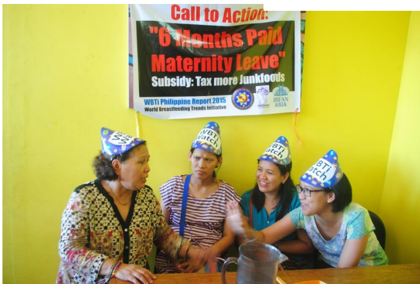
WBti Watch : old and new leaders strategizing area turf: South and North of MetroManila