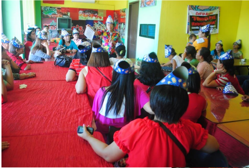
Lunch Forum's heated discussion on Panawagan/ Call to Action 2016