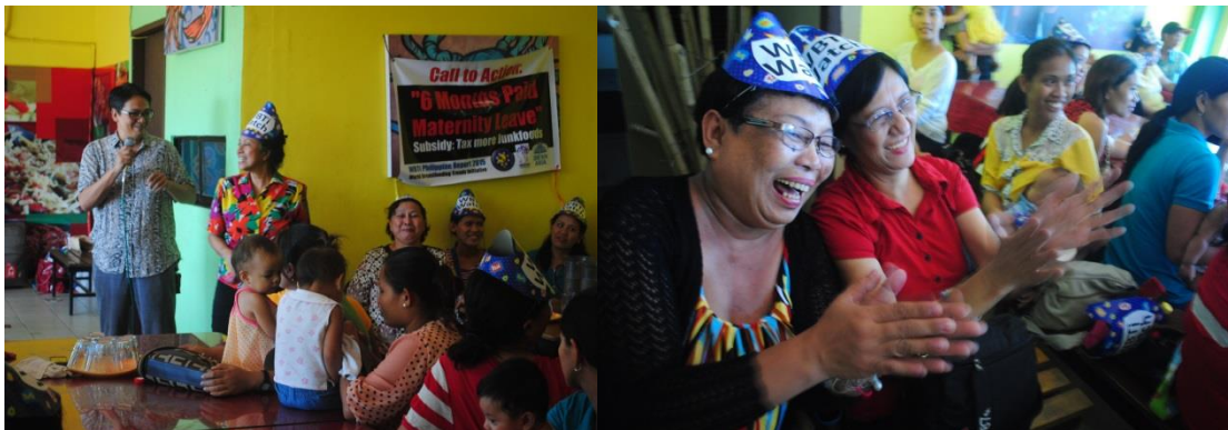
Tatays/Dads Support Group calls for extended paternity leave to complement extended Maternity Leave for participatory parenting