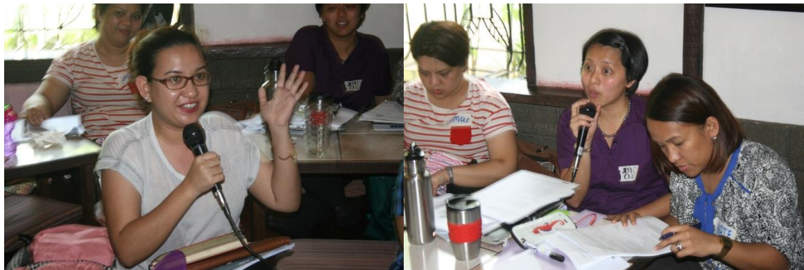
Legal disputes harmonized by 2 brilliant lawyers interpreting WBTi