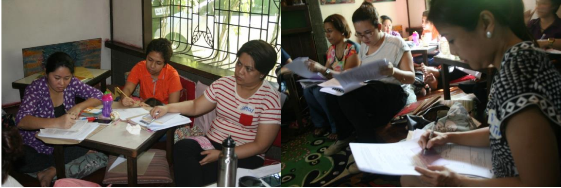
WBTi worksheets analyzed and inputted by sectoral leaders