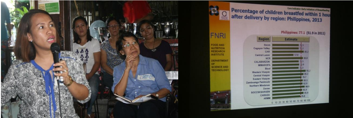
National Nutrition Council Kate presented the nutritional status of the Filipino children