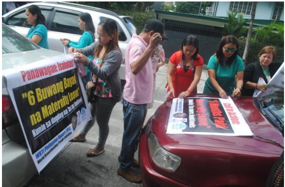
preparatory work by the WBTi Watchers

Two major cities of MetroManila: Quezon City, the seat of the Parliament/Congress and Marikina City were routed by the car caravan with banners draped on the whole cars.