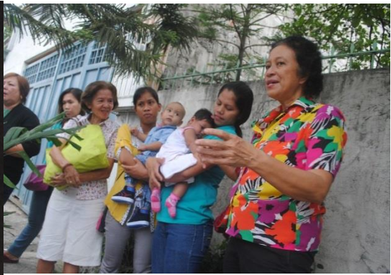
WBTi Watchers being briefed regarding strategic actions while distributing leaflets along the busy roads and pedestrians

As the cars were caught in the traffic of cars in slow procession, passengers in jeepneys, buses and private cars were intently reading the messages on the flying banners along the main roads. Effective impact wit visual recall.