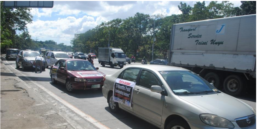
festive Christmas season made a maddening traffic along the main roads where cars are in procession with passengers on halt thus the Call to Action leaflets had them as captive readers

The public event of the WBTi Call to Action culminated with Lunch Forum. The WBTi Watch as lobby group for the Congress and Senate lawmaking bodies was launched. The event was a formality gesture as a result of the many community based consultation that transpired way back July-August-September interactive meetings with leaders.