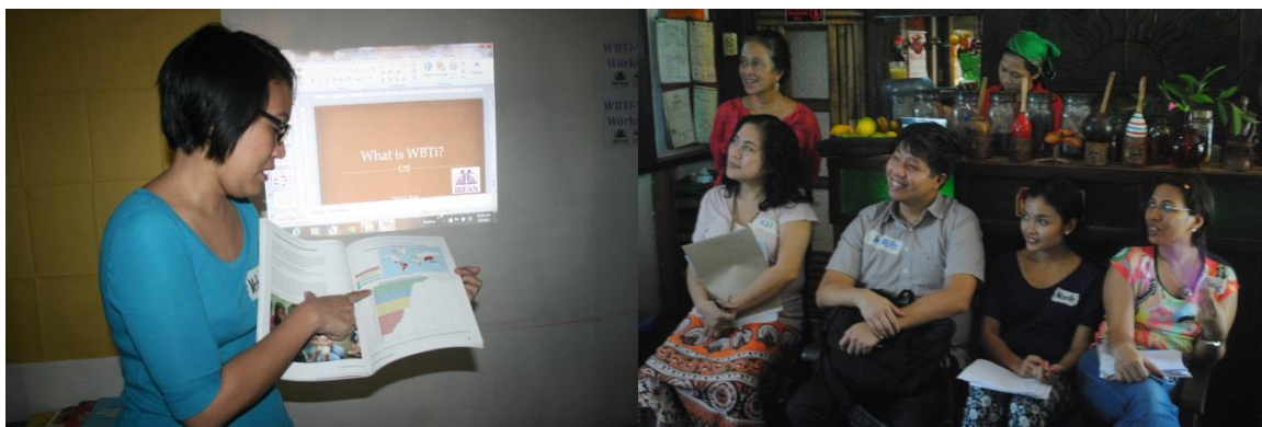
Arugaan Velvet explained WBTi background and process