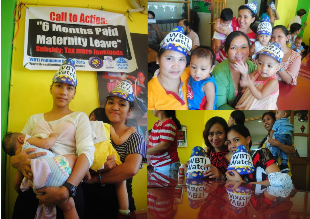
WBTi Watchers as the new lobbyist in the Congress and Senate's lawmaking process