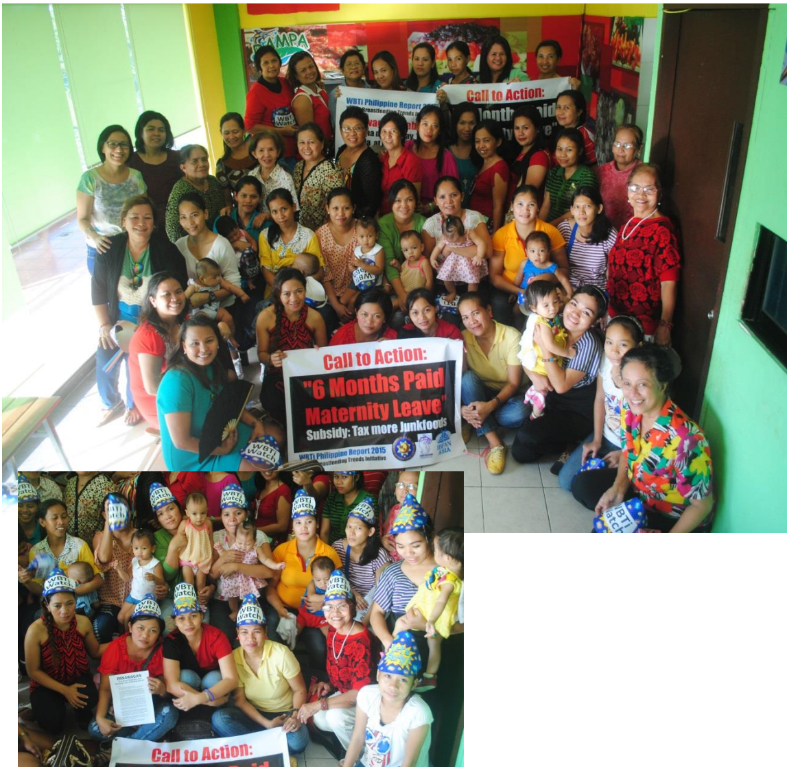
Better watch out with WBTi Watchers in Defense

The WBTi Report Call to Action cum WBTi Watch is a build up campaign for stronger action delivery come 2016 to institutionalized IYCF with Mothers as the key center of all implementing actions. Implementation en toto is remiss as what the WBTi assessment report of the Philippines concluded with Milk Code violations touch and go despite surmounting complaints and visibility. The government agencies tasked to implement by law is on snooze mode. Thus, the WBTi Watch campaign will put them to work to account for the taxpayers money where their salaries are sourced. Accountability will be the next glaring banner of WBTi Watch campaign in the Philippines.