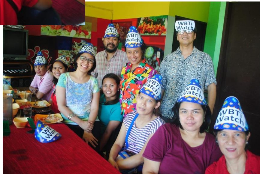
WBti Support Groups : moms and dads