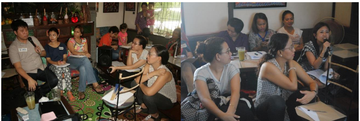
Medical point of view with 2 pediatrician leaders in defense of breastfeeding in the mainstream medical associations where Milk Code law is twisted by the milk industry predators