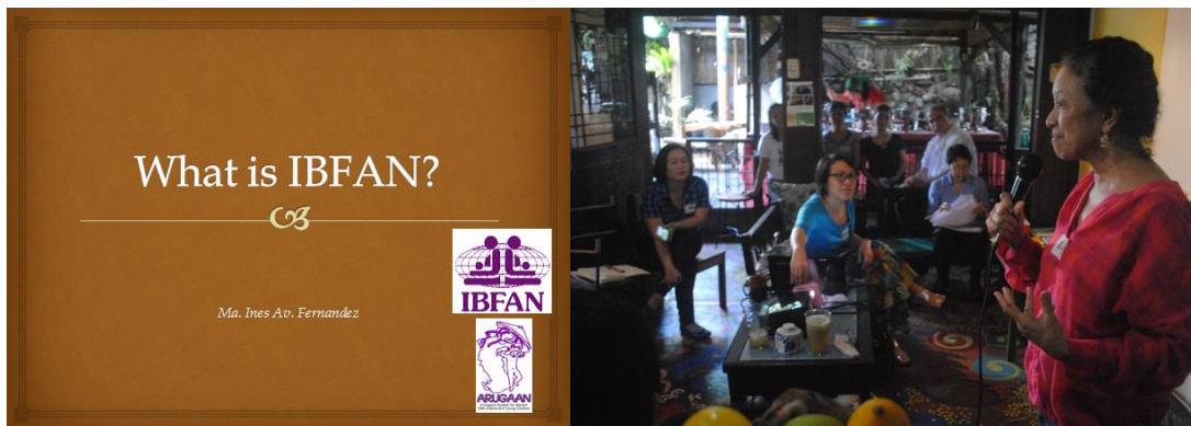
IBFAN SEA Innes expounded on what is IBFAN structure

The WBTi Assessment Report Workshop took a lot of discussion and analysis regarding the interplay of Nestlé with FNRI partnership as they launched United for Healthier Kids ( https://www.u4hk.ph ) campaign regarding conflict of interest on the Milk Code of the IYCF WBTi.