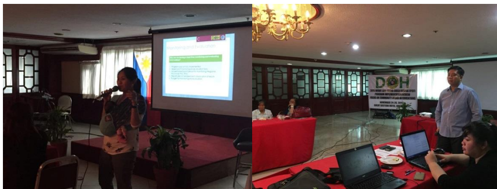
PIR on IYCF with babywearing, breastfeeding municipal health doctor and DOH

November 24-26, 2015, the DOH Family Health division scheduled a workshop on program implementation review called PIR on IYCF which were participated by government agencies nationwide representatives as well as with NGOs and UN agencies. The consensus was poor implementation from top to bottom. Also, complaints were expressed regarding Milk Code violations by the medical sector with milk companies connivance plying incentives. The DOH initiated PIR on IYCF workshop was influenced by the earlier September WBTi-WBCI workshop organized by Arugaan -IBFAN SEA. The outcome of the discussion and analysis by the leader-participants were compelling.