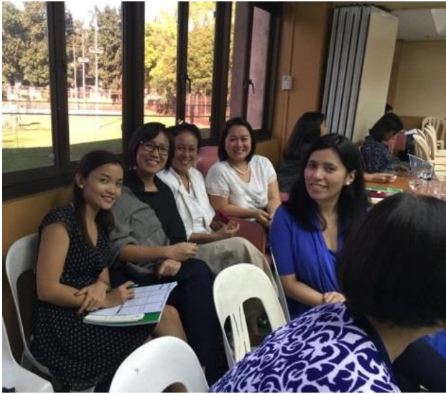
Congress' parliamentary public hearing on the Bills filed by House of Representatives for extended paid maternity leave where the mother support groups attended and corrected the data shared by DOLE - Dept. of Labor and Employment citing Vietnam with 4 months paid maternity leave against the latest 6 months ML with pay. WBTi booklet was referred by the Breastfeeding Pinays.

Last November, there was a public hearing of the pending Bills that was filed with the Committee on Women who conducted the deliberation in the House of Representatives/ Congress. The Breastfeeding groups attended the public hearings: Arugaan and Breastfeeding Pinays as well as the women's groups. The consensus was 100 days paid Maternity Leave. It fall short of ILO Maternity Convention 183 that calls for 14 weeks or 104 days. The Congressional session ends after the public hearing with the Christmas and New Year yuletide season. According to the head of the government Commission on Women who was a pioneering breastfeeding advocate said that it seemed the menu at the Senate will be the call for reconciliation meaning 100 days from Congress call or Senate's 6 months with half pay and half unpaid as option for working women. After