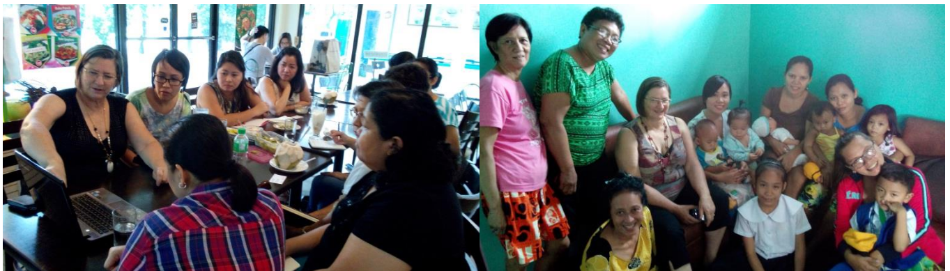
Julie Smith visits the Philippines with the mamas of Arugaan (community-based mother support groups) and Breastfeeding Pinays and ladies from Congress and women's trade unions

The August event was the biggest media coverage as the WBW theme on Maternity Protection and Working Breastfeeding Women were simultaneously launched where both international resource persons/experts graced the International Breastfeeding Conference that the Philippine Pediatric Society organized. The 1000 attendees on Big Latch On/ Hakab Na event were staged by Breastfeeding Pinays with 73,000 members on line and bloggers on internet media. The I Support Campaign by LATCH group and with Arugaan participation and facilitation of the community based mother support groups involvement. Experts Julie Smith from Australia and Miriam Labbok from USA had interactive meetings with Arugaan leaders from the communities. Lunch Forum was hosted by Arugaan with Julie Smith presenting the business arguments for breastfeeding agenda at the workplace and maternity protection entitlement.