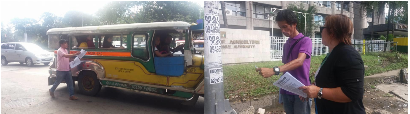
Jeepney passengers received the leaflet Panawagan/ Call to Action with 1-9 Question and Answers Whys 6 months paid maternity leave. The WBTi Watchers distributed in the office premises, passersby were reading the leaflets as they wait for their public ride

2 nd reading, the President of the Philippines will sign the law before he ends his presidential term come May 2016. Therefore, the Arugaan WBTi Call to Action was timely as there was a moratorium in December meaning many of the NGOs as well as the government are all agog in finishing obligatory report for the year ends and rushing strategic plan of action as well as enraged with Christmas fever. Thus, our car caravan with shouting banners called the public attention as many people were on the traffic streets. The Call to Action : 6 Months Paid Maternity Leave from Subsidy Tax on Junkfoods. Tatays/Dads support group expressed candidly a Call to Action for extended paternity leave to complement participatory parenting with extended paid Maternity Leave. Existing paternity leave is only 7 days while the maternity leave is only 2 months with pay. The screaming banners was synchronized with the attention honks of the car caravan. The WBTi Watchers distributed leaflets In Q& A format in Pilipino language WHYS 6 Months Paid Maternity Lave for working women 1-9 questions with answers. Many passersby who were mostly employees were reading the Call to Action/Panawagan.